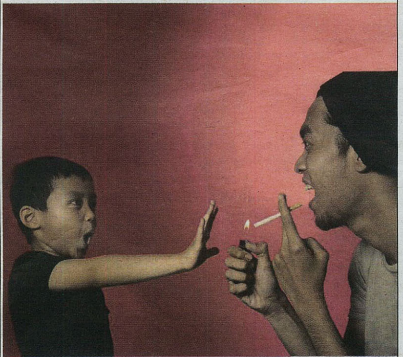
Smoking can cause erectile dysfunction and lower sperm count.

● Lack of exercise and sedentary lifestyle – Physical inactivity can be damaging to health and lead to obesity. To take back control of your well-being, start eating healthier and incorporate some form of exercise in your busy schedule.