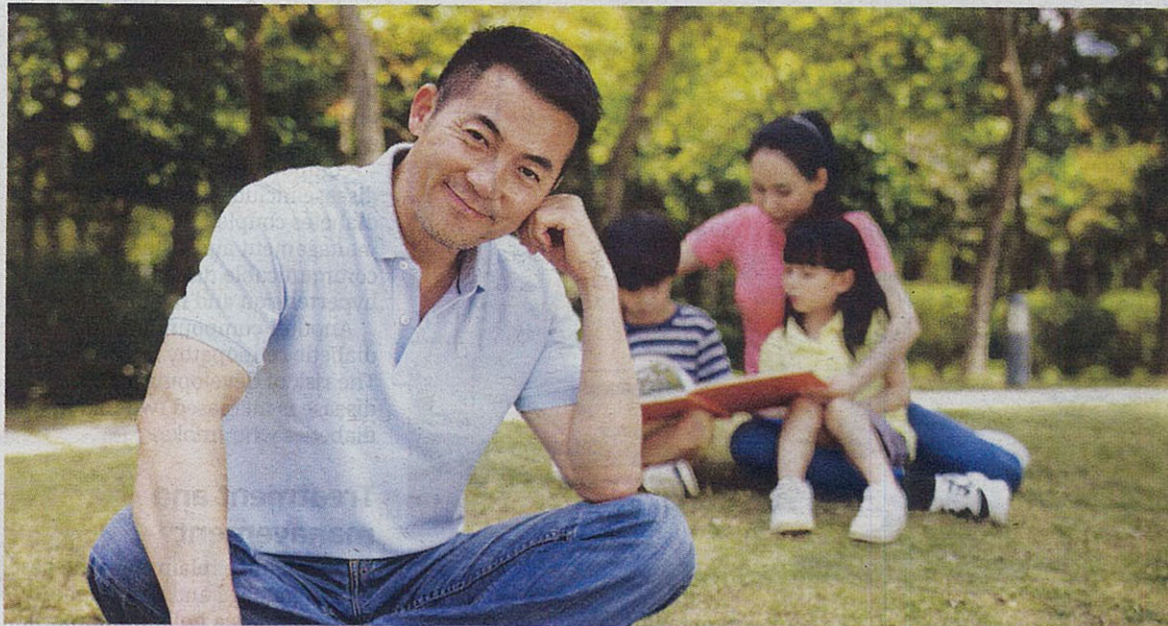
Diminished testosterone levels can effect familial relationships.

levels can lead to more serious problems, including premature ejaculation and erectile dysfunction, which can affect relationships.