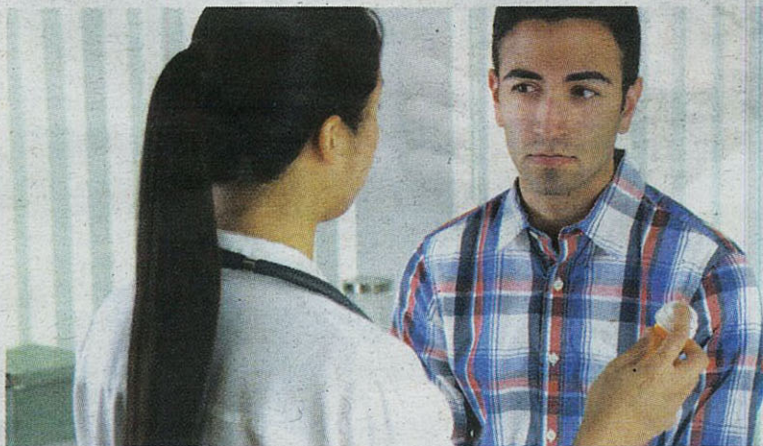
Embarrassment should not deter you from bringing your health issues to a doctor.