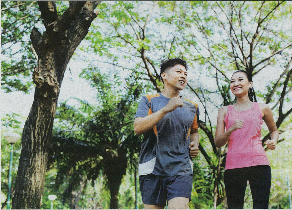
Sexual and reproductive health contribute to an overall sense of well-being among men and women alike.